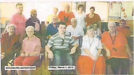
Friday, March 1, 2013

Valentine's Day can be a lonely holiday for the elderly people of Huis Dien Bothma, because some of them may have spent the day with their families or friends. To make their day special, SAVF Huis Dien Bothma Old Age Home organised a Valentine's Day celebration for the elderly on Thursday 1st.