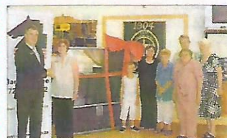
Friday, March 22, 2013